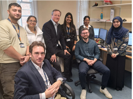
Lord Cameron's visit to DPUK

Pics and Origin projects publicly launched. Attune, exploring young people's mental health and adverse childhood experiences (ACEs), held its first conference. Photographs taken by participants on the Co-Pact project were exhibited in Manchester and London.