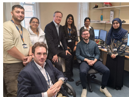
Lord Cameron's visit to DPUK

The CHiMES Collaborative's Co-Pics and Origin projects publicly launched. Attune, exploring young people's mental health and adverse childhood experiences (ACEs), held its first conference. Photographs taken by participants on the Co-Pact project were exhibited in Manchester and London.