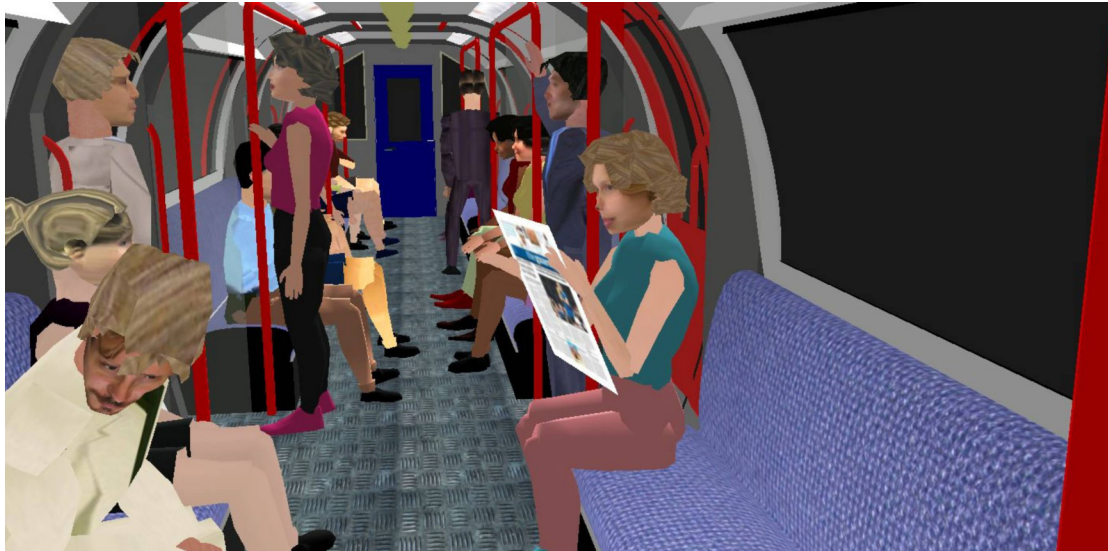
Fig. DS1 Scene from the virtual reality environment.