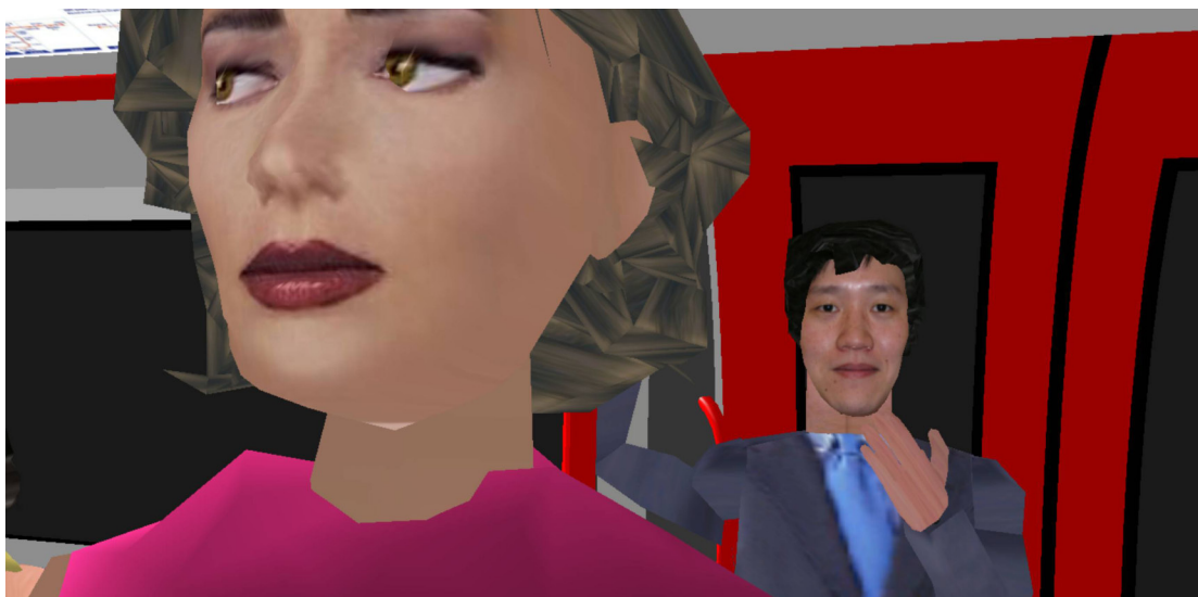
Fig. DS3 Two of the virtual reality characters.