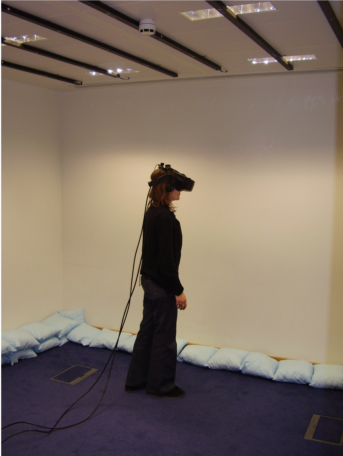
Fig. DS2 The virtual reality equipment.